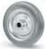
112 / ANTIMACCHIA NO-MARKING