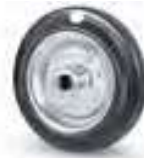
112AO / ANTIOLIO OIL-PROOF