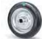
112BM / BUNESCOLA 70 Shore A TWO-COMPONENT MIX 70 Shore A