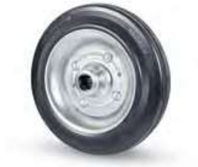
112 / GOMMA PIENA 80 Shore A RUBBER TYRE 80 Shore A