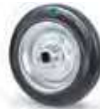
112SE / SUPERELASTICA 70 Shore A SUPER ELASTIC 70 Shore A