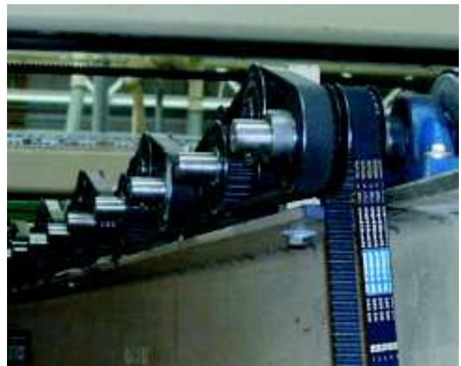
Application example: roller path