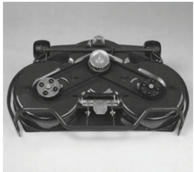
Application example: lawn mowers

The geometry of the optibelt OMEGA tooth profile has been developed to run in the established, curvilinear timing belt pulleys. optibelt OMEGA timing belts can be used in 3M, 5M, 8M and 14M HTD® pulley profiles. optibelt ZRS HTD® timing belt pulleys are standard items in our range with pilot bores or bored for optibelt TB taper bushes. In addition, all OMEGA timing belts can also be used in RPP® timing belt pulleys. Special timing belt pulleys for optibelt OMEGA timing belts are not required.